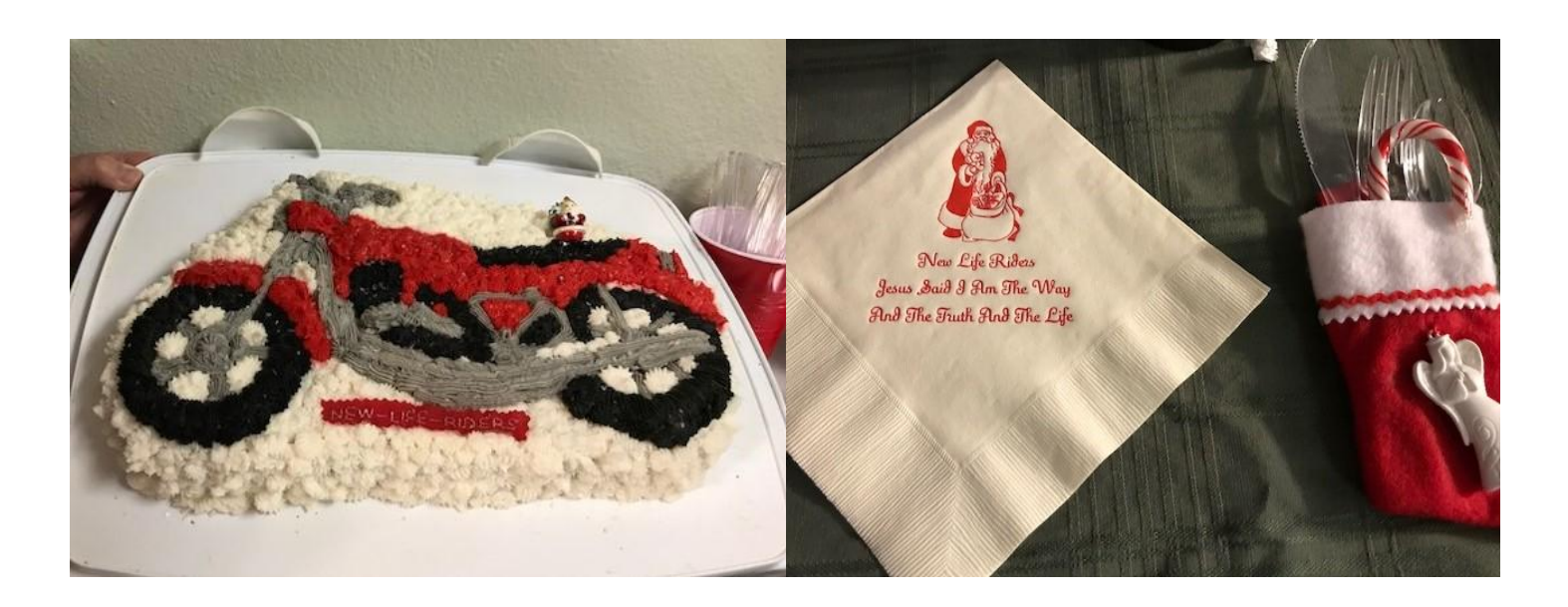
Jesus said, "Go into the world. Go everywhere and announce the Message of God's good news to one and all." Mark 16:15 (The Message)